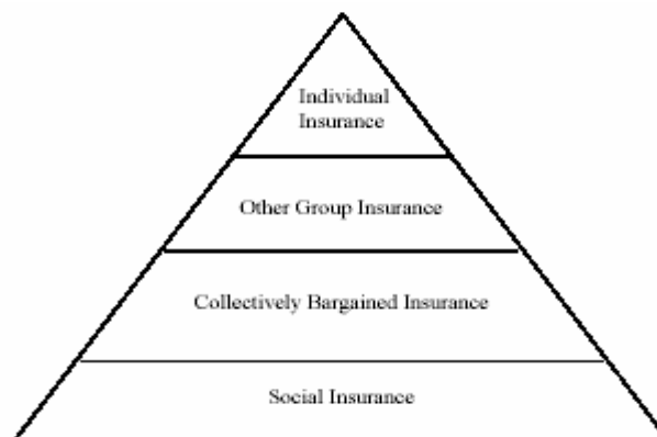
FIGURE 1 The Insurance pyramid

Figure 1 shows alternative insurance structures and their relationships to each other. Social insurance is at the bottom of the pyramid and protections provided are usually designed to give economic security to large sections of the population. Most definitions include the elements that social insurance schemes have been established through a political process and that the schemes are compulsory for all concerned. The most common schemes provide a degree of income replacement in case of e.g. work-place accidents, sickness, disability, retirement, unemployment and maternity leave and are financed by general tax revenues, special taxes, levies or charges. The schemes may be run by government institutions, special-purpose institutions or the private sector. Social protection is broader than social insurance, and can be defined as “the set of policies and programmes designed to reduce poverty and vulnerability by promoting efficient labour markets, diminishing people’s exposure to risks, and enhancing their capability to protect themselves against hazards and interruption or loss of income” (CGAP (2003), p.29). 6 Consequently, insurance is not a substitute for social protection schemes but should be complimentary to it.