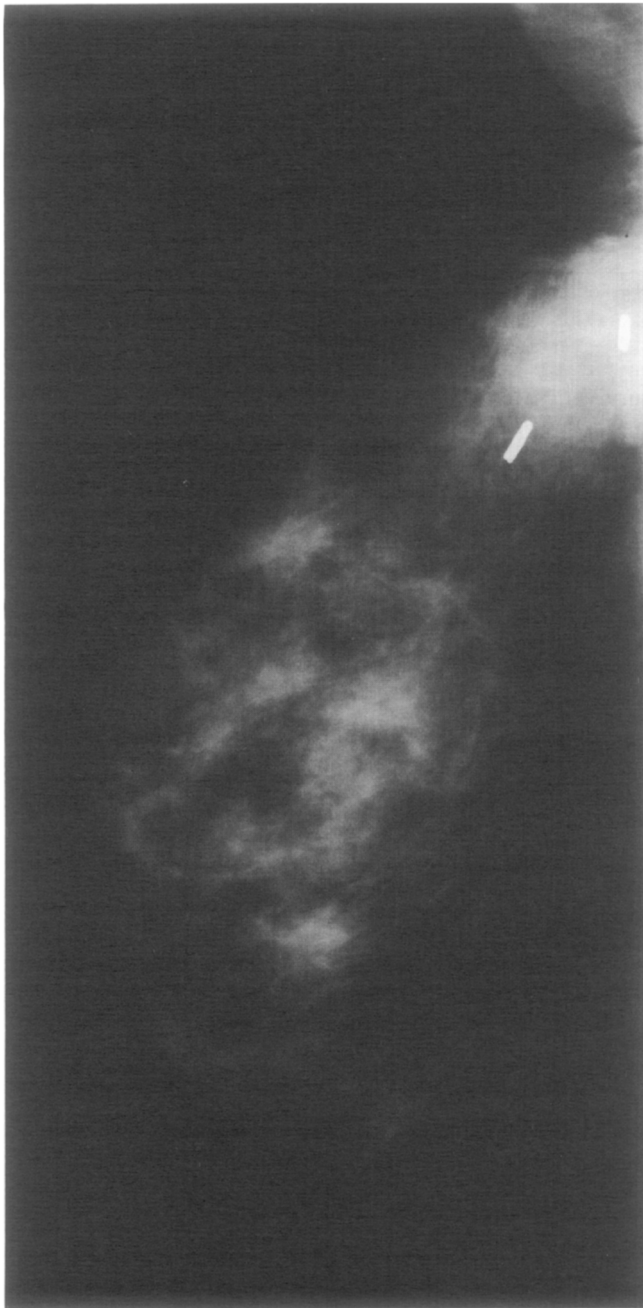
Fig. 1 Mammography of May 1992 showing a dense area of 1.5 cm with irregular margins at the site of the haemoclips placed during the primary operation in 1981.