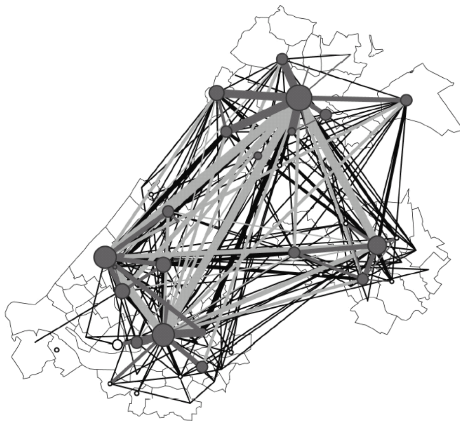
Figure 3 The network of inter-firm relationships in the Randstad