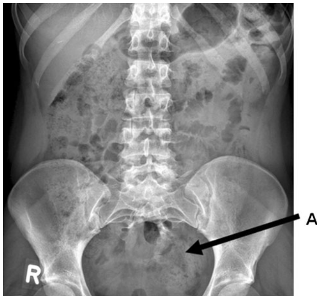
Fig. 1 Pelvic X-ray Arrow A : the partial sacral agenesis

procedure. Furthermore, she had suffered from grade III vesico-ureteral reflux. X-ray imaging of the lumbar spine confirmed a partial sacral agenesis, sickle-shaped sacrum (Fig. 1). After surgery, constipation resolved without fecal incontinence. She was followed-up by the pediatric surgeon. Otherwise, she was in healthy condition and is currently employed as a registered nurse.