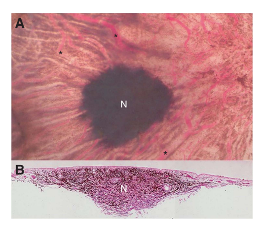
Figure 1. Clinical and histopathological manifestation of a choroidal nevus. (A) Choroidal nevus (N) (72 year old, female). Retina and RPE removed; choroidal vessels visible (asterisk). Size \sim 4 mm diameter. (B) Section through nevus showed thickened area of pigmented nevus cells and large blood vessels at the lesion's edge (arrows) (periodic acid–Schiff stain).

In this study, we analysed the frequency of GNAQ/11 mutations in choroidal nevi and analysed YAP activation as a possible downstream effect.