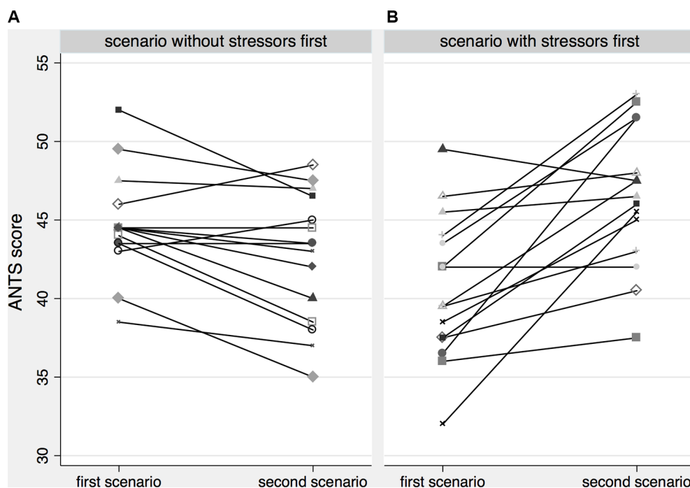
Figure 2 Non-technical performance scores (Anaesthetists' Non-Technical Skills (ANTS) scores) during cardiopulmonary resuscitation scenarios for participants in whom external stressors were added to the second scenario (A) or to the first scenario (B). Individual ANTS scores of each participant are connected by a line. In (A), ANTS scores significantly decrease when external stress is added in the second scenario ( p=0.011 ), while ANTS scores increase on (B) in the second scenario without external stressors ( p<0.001 ).

Non-technical performance scores were significantly lower when external stressors were present compared with control scenarios. In the group of participants who were not confronted with stressors during the first scenario, adding a stressor to the second scenario was associated with a significant decrease in ANTS scores ( 44.7 \pm 3.3 (mean \pm SD) vs 42.6 \pm 4.1 , mean of the paired differences -2.0 , 95% CI -3.5 to -0.6 , paired t-test p value = 0.011, figure 2 ). In the group of participants who were presented the scenario with external stressors first, ANTS scores significantly increased in the second scenario ( 40.7 \pm 4.6 vs