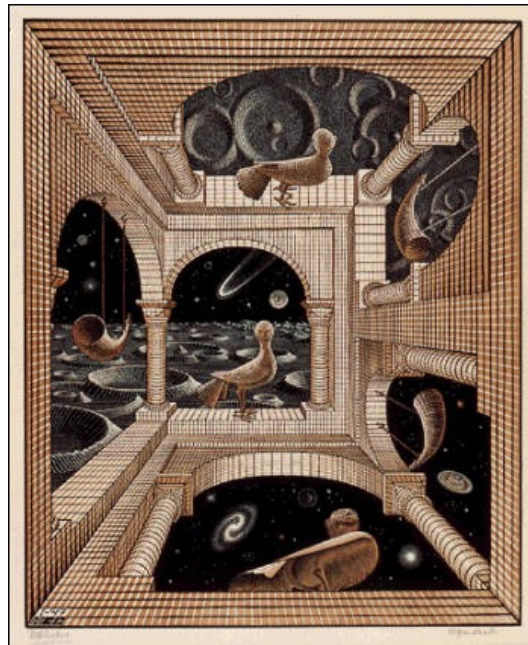
Figure 4: M.C. ESCHER's "Other World," © 2015, The M.C. Escher Company, the Netherlands 23 [33]

The wood engraving: Other World by M.C. ESCHER (1947), which I stumbled upon while writing my book on qualitative analysis (EVERS, 2015a), intuitively seemed a perfect image of the idea of triangulation, as it pictures the surface of the moon and outer space from two different viewpoints, while at the same time picturing both a horn and a Simurgh from three different angles, as is visible in Figure 4: