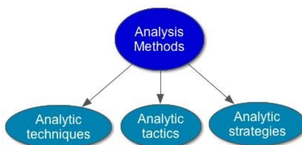
Figure 1: Categorization of analysis methods [19]

To facilitate the use of thick analysis, I have developed a categorization of analysis methods . I make a distinction between analytic techniques , analytic tactics and analytic strategies 9 ; together they form the analysis methods one can choose from. All three of them will probably be employed during a qualitative analysis, but how and in which order is a decision the researcher will make differently in each project. In Figure 1 they are illustrated.