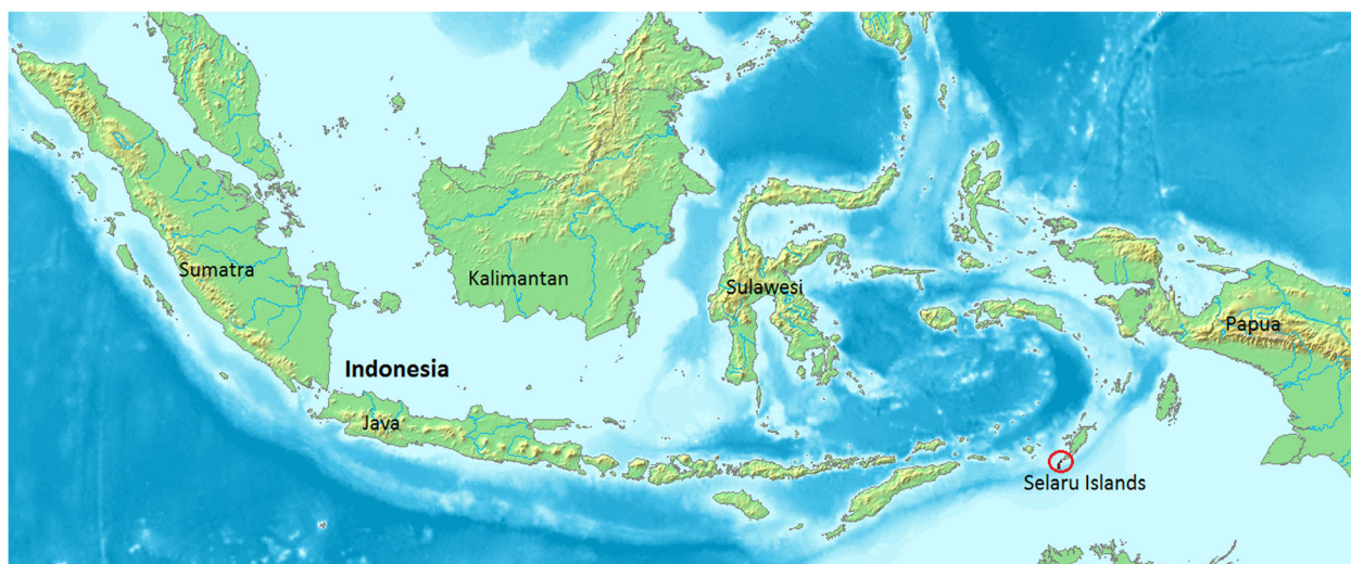
Fig. 1 Location of Selaru Island in Indonesia

in the past two years, under the age of 2 years, and suspect of having tuberculosis. The aim was to reach at least 80% of the population, because a high coverage is desired to break the transmission chain by sufficiently reducing the bacterial load of M. leprae in the population. The target was not achieved during the first visit because many people were away from their houses to earn livelihood. Therefore, the first (baseline) visit was extended with a second visit in November 2015 to cover the absentees of the first year visit. Individuals who had received SDR during the first visit were not re-examined for leprosy during the second visit. During the study period, SDR was given only once to an individual.