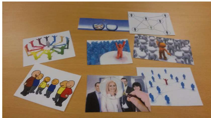
FIGURE 1 Example of a cluster of visual statements made by one of the 17 participants in the structuring step of the concept mapping