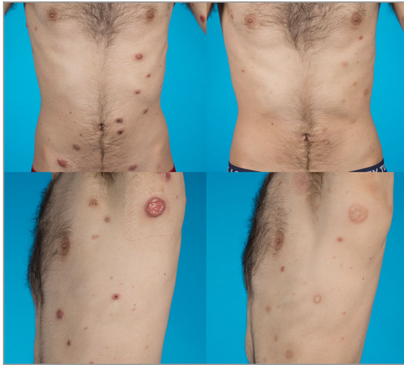
Fig 1. Patient with multifocal cutaneous anaplastic large cell lymphoma before (left) and 5 months after (right) treatment with methotrexate 10 mg showing partial response (patient 24, Table 2).