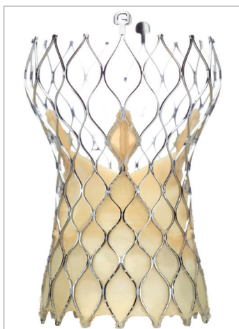
Figure 1 The CoreValve Evolut R. The CoreValve Evolut R has been redesigned to provide more consistent radial force across the sizing range with modified cell geometry to improve conformability to the aortic annulus. The new valve release mechanism has a paddle design to prevent hang-ups and the porcine pericardial leaflets are treated with alpha-amino oleic acid (AOA®) to retard mineralisation.

The cell geometry and frame of the Evolut R have been redesigned to optimise frame interaction with the native anatomy, to improve conformability to the aortic annulus and