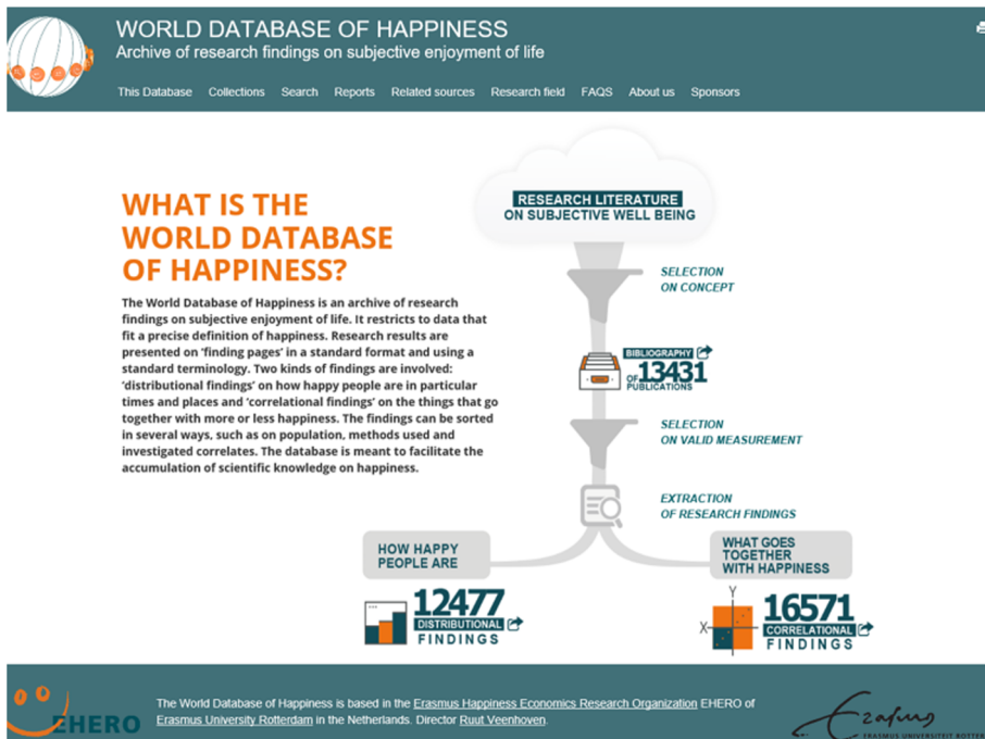
Fig. 1 Start page of the World Database of Happiness, showing the structure of this findings archive