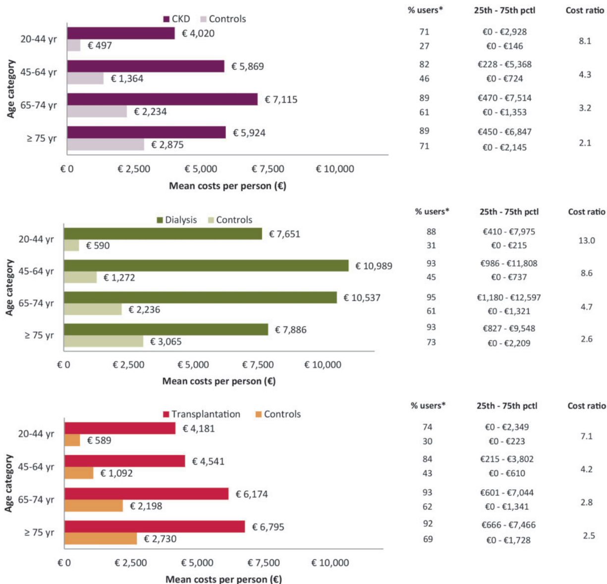
FIGURE 2: Hospital costs unrelated to treatment of CKD Stage G4/G5 not on RRT, dialysis and kidney transplant patients versus hospital costs of matched controls. *Denotes the percentage of users per group that incurred costs for care in that specific cost category.

categories or young and middle-aged patients were more costly than elderly patients. Of note, costs for CKD Stage G4/G5 and dialysis patients \geq 75 years of age were lower than for patients 65–74 years of age. We further demonstrated that young patients in particular incur considerably higher costs than controls, which is reflected by the decreasing cost ratios with age. Furthermore, we showed that renal patients were in greater need of additional specialist care because of kidney disease-related comorbidities. Although it is known that the burden of comorbidities is higher in elderly CKD patients, this study shows that costs related to comorbid illness in young patients is similar to that of elderly patients.