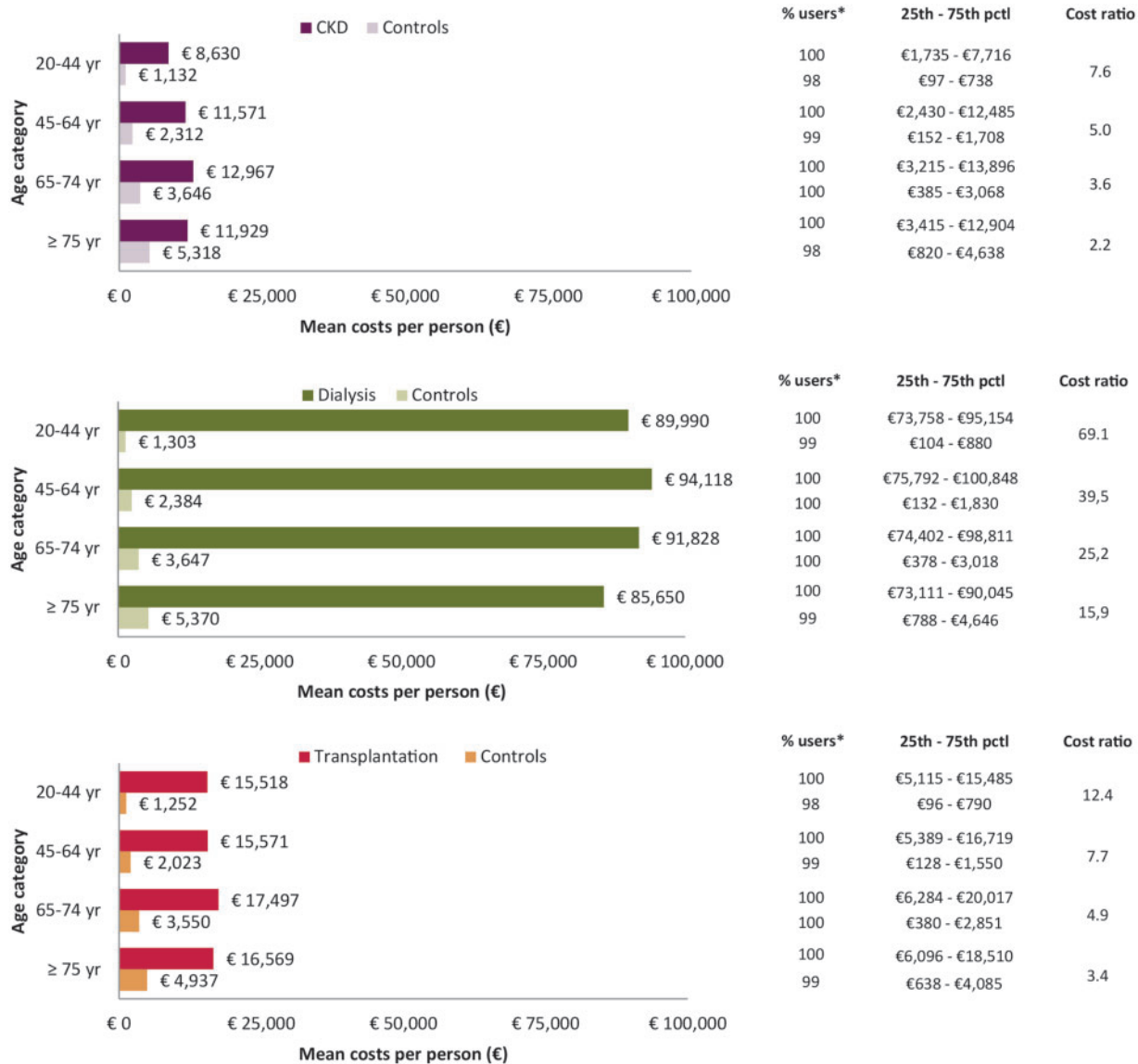
FIGURE 1: Total annual health care costs of CKD Stage G4/G5 not on RRT, dialysis and kidney transplant patients versus matched controls. *Denotes the percentage of users per group that incurred costs for care in that specific cost category.

Surgery. Twenty-nine percent of young dialysis patients and 40% of elderly patients needed surgical care versus 5 and 12% of controls, respectively (Supplementary data, Figure S3b). In the oldest dialysis patients, this was 35%. For both CKD Stage G4/G5 and transplant patients, surgery costs were lower for patients \geq 75 years of age than for patients 65–74 years of age.