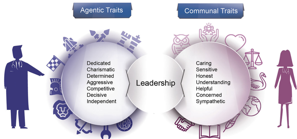
Fig. 3 Demand-role congruity theory: agentic and communal traits associated with male and female gender, respectively (based on Eagly et al [28])

themselves self-critically and reservedly, or not present themselves for leadership positions at all. Male applicants, in contrast, are often admired for their self-confidence and assertiveness and are more likely to present themselves as desirable for positions. It is therefore incumbent upon employers to become aware of their own unconscious biases as well as the unconscious reservations of potential female appointees. In particular, it is important to recognize that women leaders may not fit the traditional mould of male leaders. Female leaders need not adopt stereotypically masculine behaviors to be effective; in contradistinction, they may be more influential and inspiring leaders through emphasis of traditionally feminine traits.