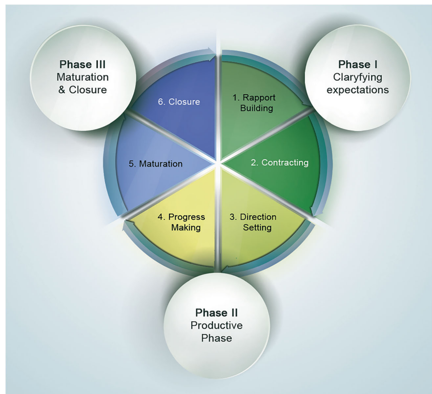
Fig. 4 The mentoring cycle (adapted with permission from UCD People Development & Organisation Effectiveness, Human Resources, University College Dublin, http://www.ucd.ie/hr )

of females in higher positions, women often have mentors with “less organizational clout” [38]. Indeed, research suggests that men help women gain higher-level positions and higher salaries, and women view them as better sponsors due to their connections.