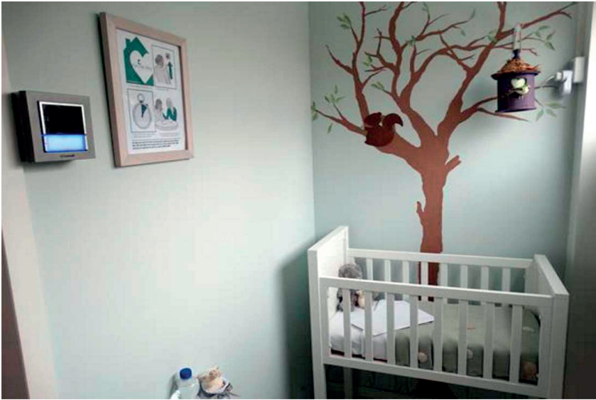
Figure 1. The foundling room in Papendrecht, the Netherlands.