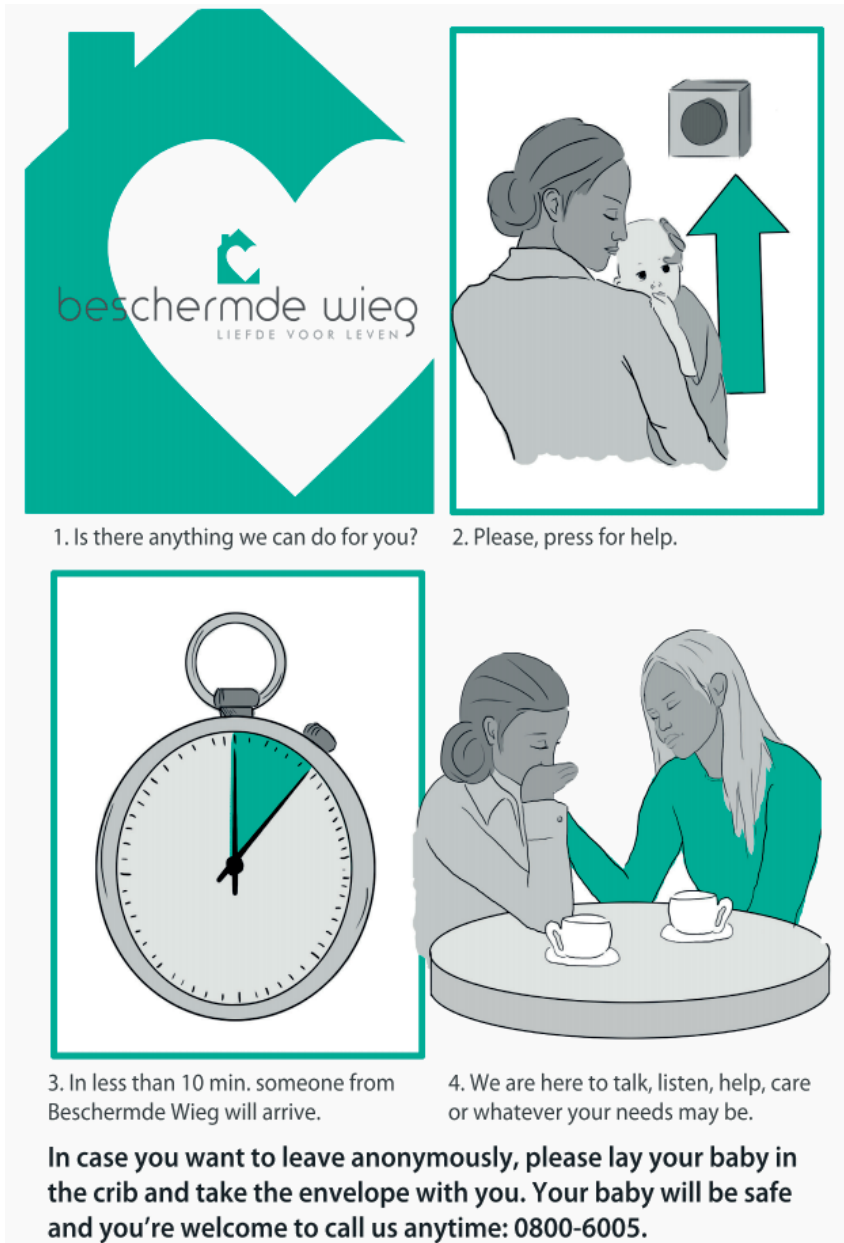
Figure 2. Wall poster.