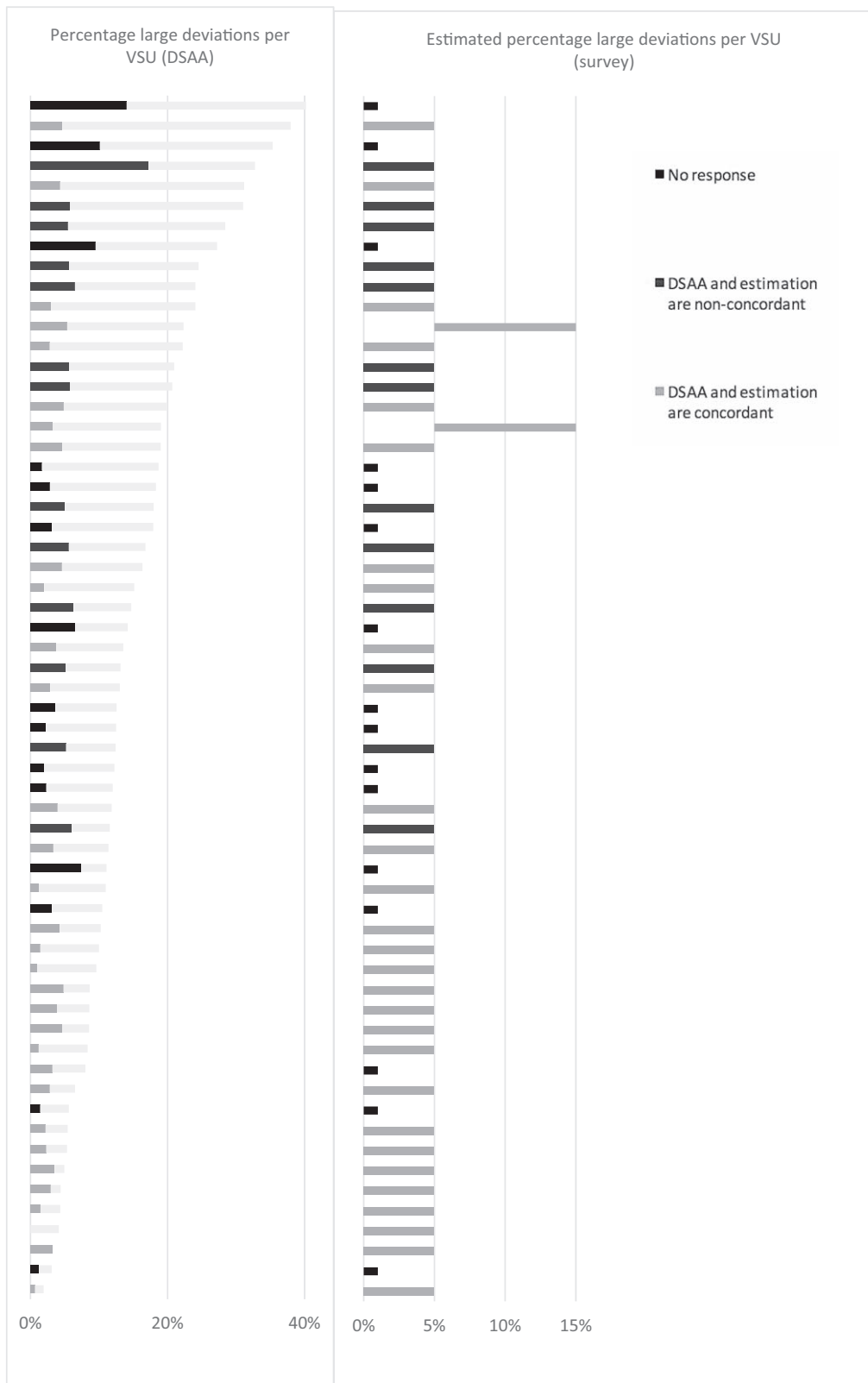
FIGURE 3. Comparison of actual percentage large deviations and estimated percentage per vascular surgical unit.