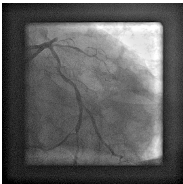
Fig. 2 Acute angiography of the left coronary artery showing an acute thrombotic occlusion of the proximal left anterior descending artery (LAD) and significant stenosis in the circumflex artery