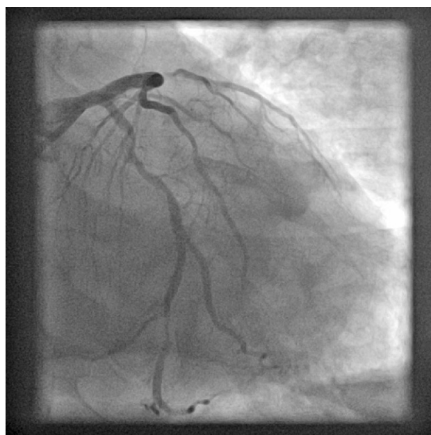
Fig. 3 The final result after primary angioplasty with good antegrade filling of the LAD including the diagonal and septal branches