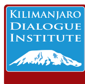
TANZANIA Kilimanjaro Dialogue Institute