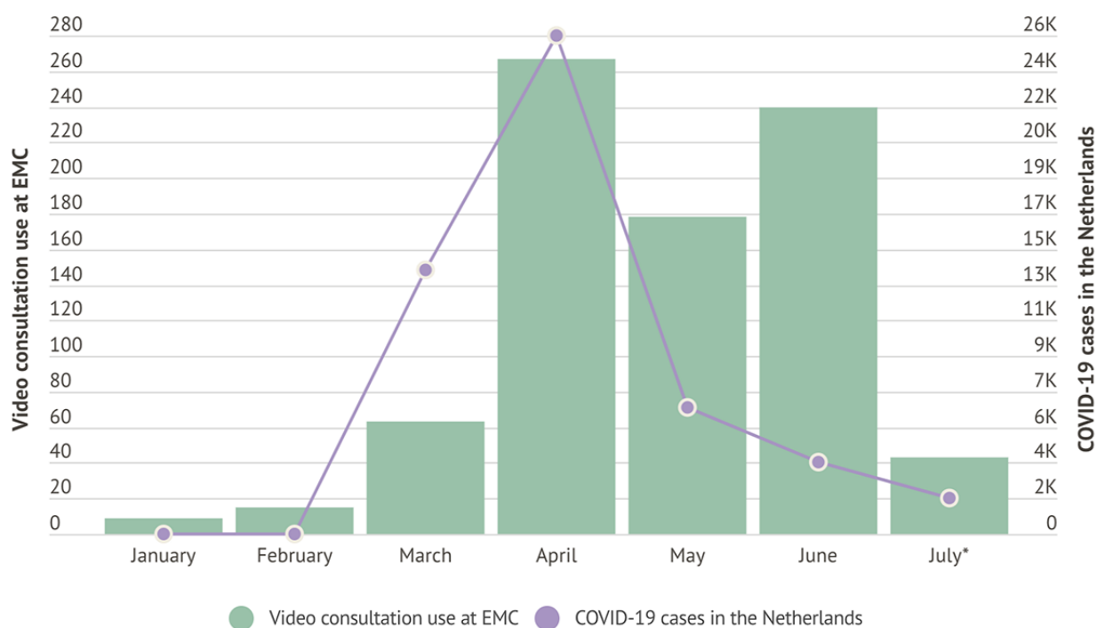
Figure 1. Video consultation use over time and COVID-19 cases in 2020. EMC: Erasmus University Medical Center.

The rapid demand for teleconsultations required that more health care personnel be rerouted to cover the need, and steps had to be taken to increase the bandwidth of the service. It is in this context that our institution needed to develop an internal strategy for communication and training regarding the use of these digital