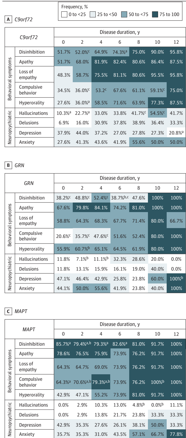
Figure 1. Frequency of Behavioral and Neuropsychiatric Symptoms in A, C9orf72 Expansion; B, GRN ; and C, MAPT Carriers

C9orf72 indicates chromosome 9 open reading frame 72; GRN , granulin; MAPT , microtubule-associated protein tau.