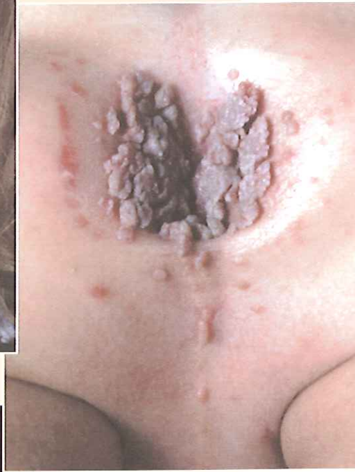
FIGURE 4. Condylomata acuminata.