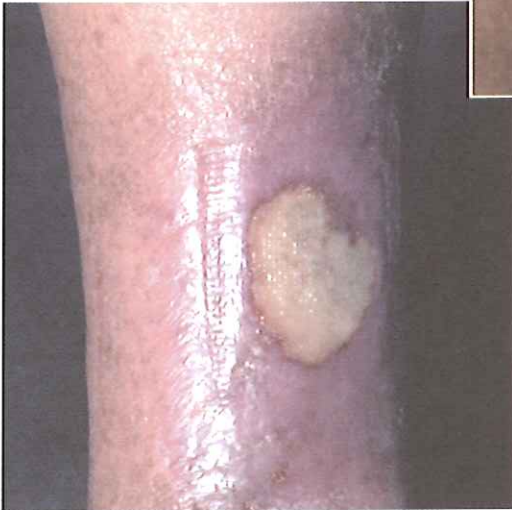
FIGURE 6. Leg ulcer.