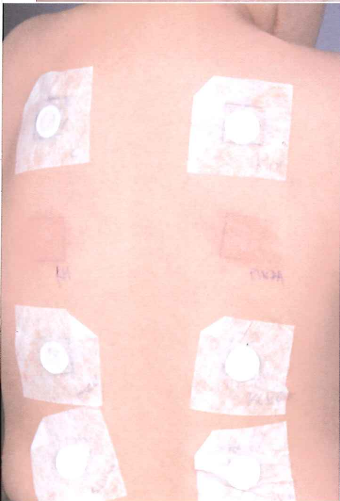
FIGURE 2. The Skin Application Food Test (SAFT).