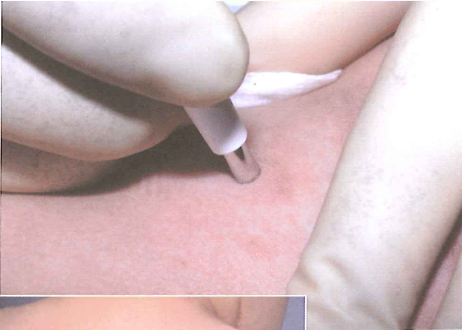
FIGURE 1. Skin biopsy procedure.