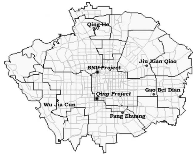
Figure 2 | Location of Beijing centralized wastewater reclamation plants and the two projects studied.

Fourthly, as listed in Table 1, the economic benefits generally include cost saving on constructing pipes, cost saving on water purification and distribution, and reuse of pollutants. Being the conventional systems, centralized wastewater reuse systems have been applied in Beijing for many years, which need huge investments on pipes construction for reclaimed water distribution due to the long distance between centralized plants and users. Compared with centralized wastewater reuse systems, decentralized systems require shorter reclaimed water distribution pipes so that the huge cost of pipes construction can be saved. As the capacity of a decentralized plant is usually limited, the cost saving on water purification and distribution is so small that it can be ignored in the current analysis. Generally the pollutants of decentralized wastewater reclamation are not reused in the Beijing urban area, so the benefit of reuse of pollutants is not considered in the study. As a result, only the cost saving on pipes construction is selected for the economic benefits analysis. Cost saving on water purification and distribution, and reuse of pollutants are neglected in the economic benefits analysis.