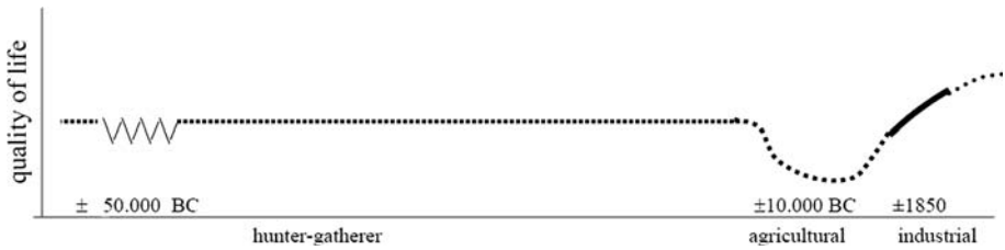
Fig. 5 Long-term trend in quality of life