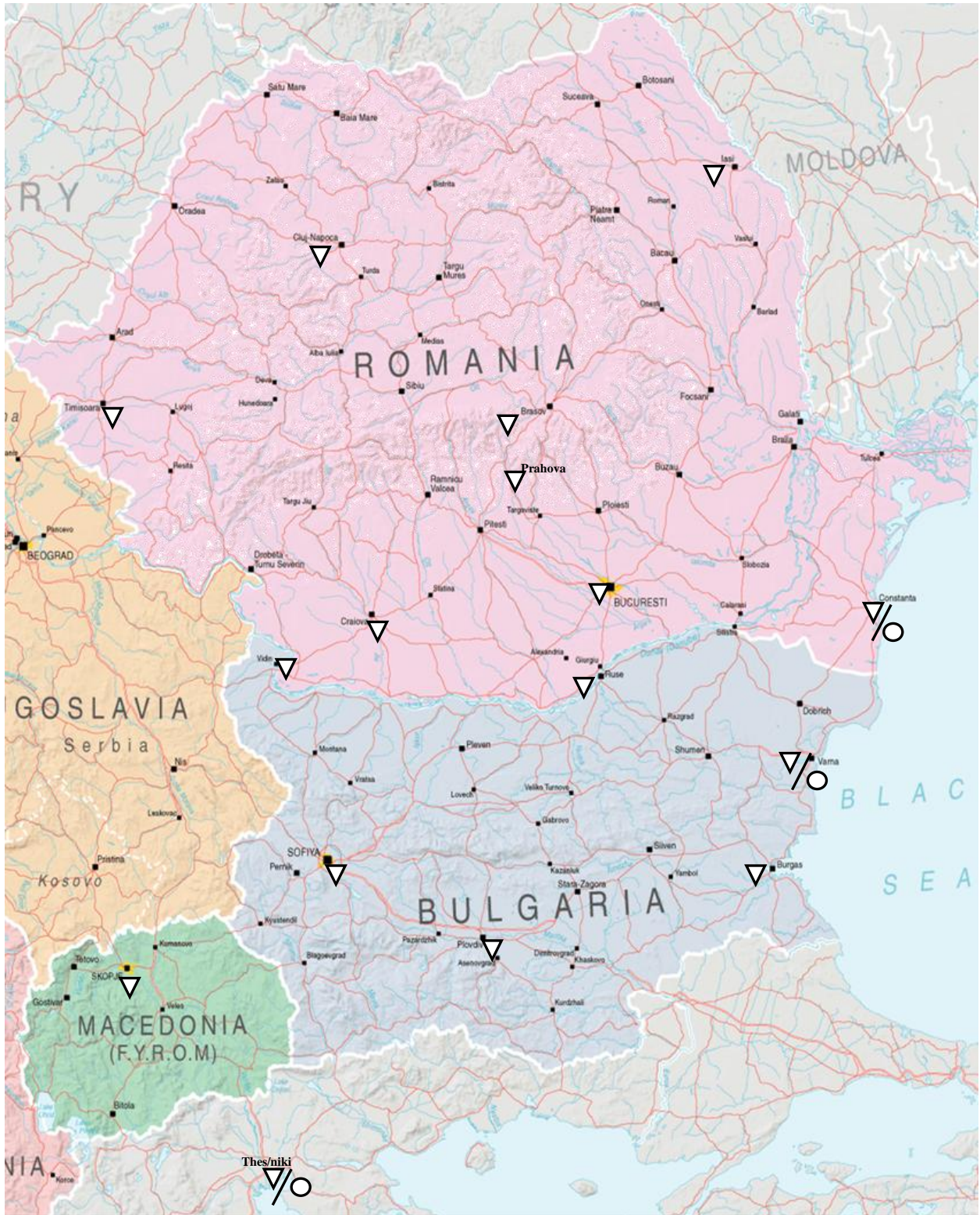
Figure 2: Map of the Region with major Supply Chain Nodes

The shipping network utilized in this case study involves Gioia Tauro (in Calabria, Italy) as transshipment hub and the 3 examined Entry Points. We assume that a typical mother vessel (6000TEU) is deployed in order to transport TEU flows from Shanghai to Gioia Tauro. The associated flows are then transhipped onto feeder vessels that call at the examined Entry Points.