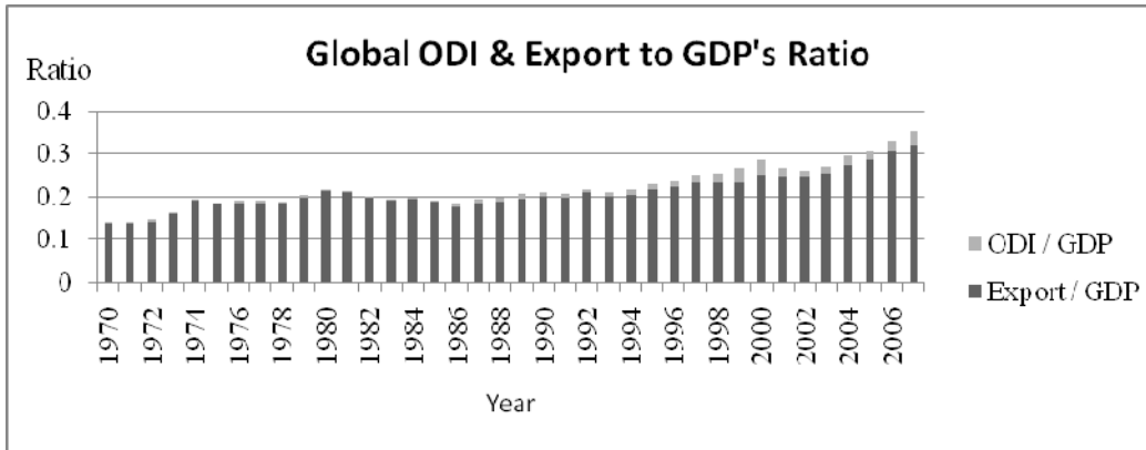
Figure 3. Global ODI & Exports to GDP Ratio