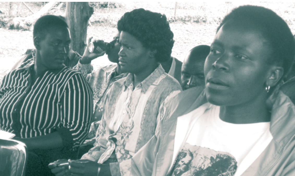
Above: Participants included women representatives of Makuleke CBOs.

NOTIFY THE COMMUNITY: The relevant local leadership structure should be notified when the researcher has completed their fieldwork. This should include a short description of how the fieldwork went, any preliminary insights, expression of thanks, and discussion of the way forward. The next steps in the research process and the time that it will take before results are ready for feedback must be made clear.