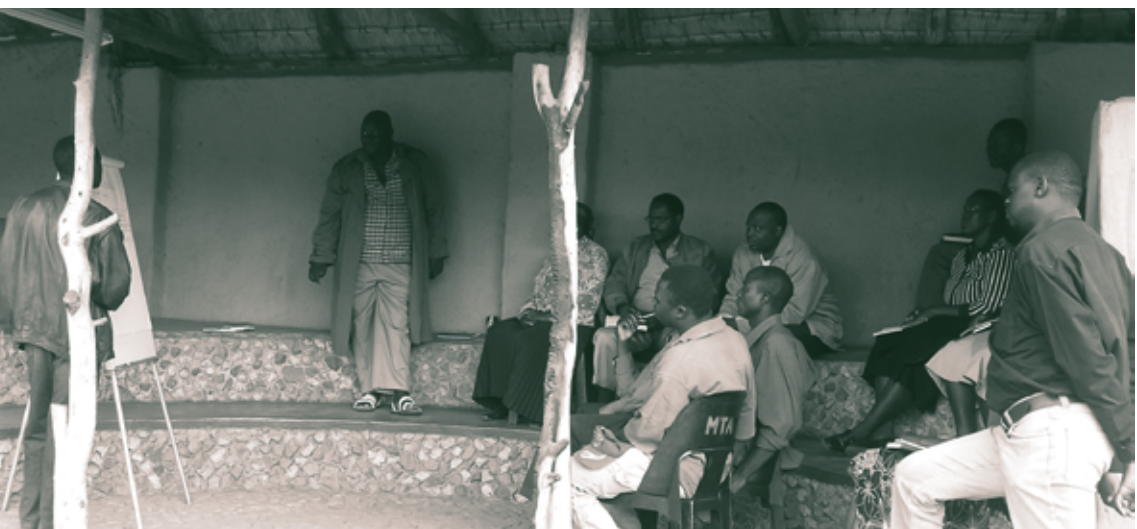
Above: Break-away session during Makuleke Workshop, October 2005.

One potentially useful tool for facilitating feedback to local people, and dialogue between them and researchers was already identified at this stage, namely a community web-portal. This was seen as an important way to disseminate information within local communities and to researchers located elsewhere in the world. Such a website would also help to reduce the research fatigue resulting from the large number of researchers visiting communities and repeatedly asking the same questions.