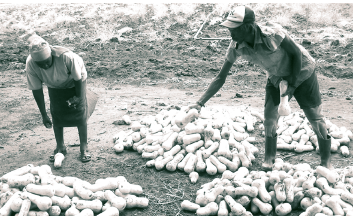
Above: Farm workers whose views on social research were elicited.

OUTCOMES OF THE RESEARCH: You should always know how to obtain feedback about the research. This could take place in different forms which are generally discussed with the leadership of the community or leading institutions in the community. These could include oral or written feedback. Oral feedback could take place with the leadership, larger groups or general community meetings. The printing and binding of entire academic reports (theses) is expensive and only one or two copies may be made available on a community level. You may nonetheless request that several copies of a summary report of the research be made available in printed form. Once you have been given feedback about the research and the researcher's analysis and conclusions, you may respond to these and discuss your views with the researcher. Should you have any