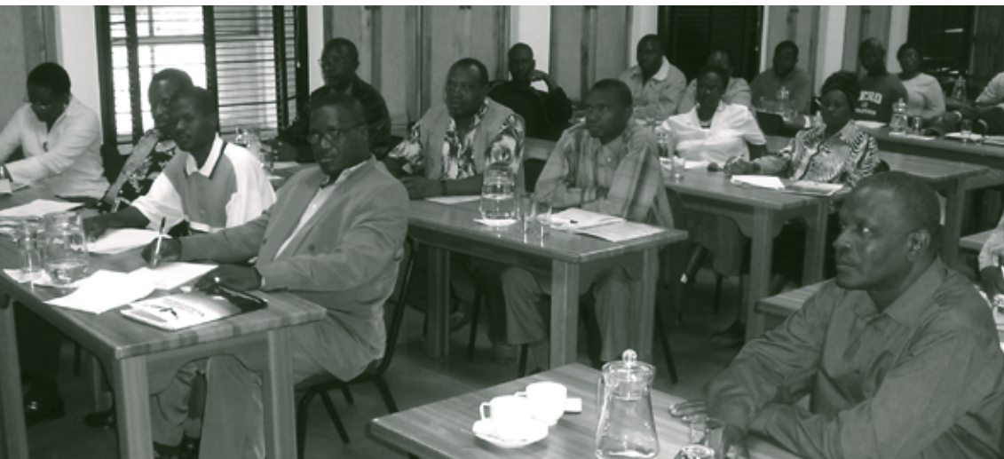
Above: Plenary session at Main Post Indaba Workshop, November 2005