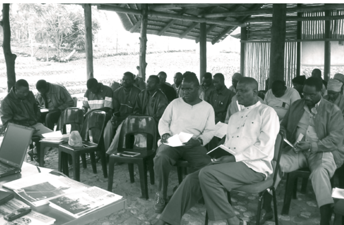
Above: Makuleke post-Indaba workshop, October 2005