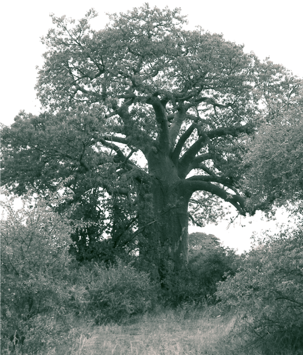
"Deku's Tree" in Old Makuleke: A reminder of local communities' heritage within Transboundary Protected Areas.