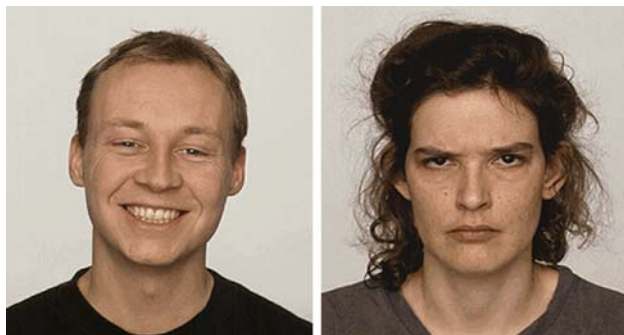
Fig. 2 Examples of different expressions in the Identification of Facial Expressions (IFE) task. Children are presented with four different tasks (each corresponding to one of four target emotions: happy, sad, anger, and fear). For each task, children are required to focus on a particular emotion, and to judge whether the face displays a specific target emotion. The target consists of an adult face expressing one of four emotions. When the face matches the emotion a ‘yes’ response is required, when the face does not match the emotion, a ‘no’ response is required. A total of 40 trials per emotion condition were presented, with half of those trials requiring a ‘yes’ response (target), and half requiring a ‘no’ response (nontarget). RT and accuracy (i.e. proportion correct) for target and non-target conditions were calculated

processing. Assumptions underlying the use of parametric statistics were examined for each outcome variable. Where assumptions of normality were violated, transformations were applied. Only variables representing accuracy (for target and non-target conditions) were transformed. For these, we applied the arc sin transformation, since this is appropriate for proportional data (Howell 1997). Following these transformations, data were appropriate for the use of parametric statistics. For the repeated-measures ANCOVA’s, Wilk’s lambda and corresponding F -statistics and significance are presented where Mauchly’s test of sphericity was not significant. Where this test was significant, the corrected Greenhouse-Geisser degrees of freedom and significance levels are presented. Two-tailed tests were used. Effect sizes (small: \geq 0.02 and \leq 0.06 ; medium: > 0.06 and \leq 0.13 ; large: \geq 0.14 ) were estimated using partial Eta squared ( \eta_p^2 ) (Stevens 1992).