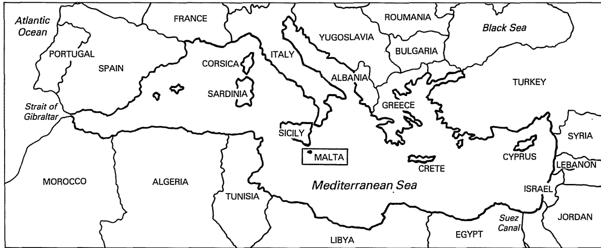
Map 1: Location of the Maltese Islands in the Mediterranean Region