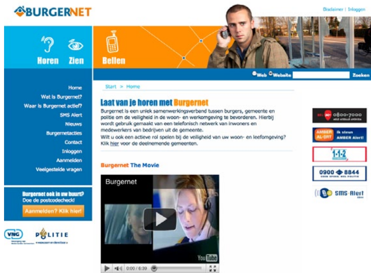
Figure 5: Burgernet connects Dutch police forces with the general public

As offenders use social media to plan, carry out or announce their plans, vendors expect a growing