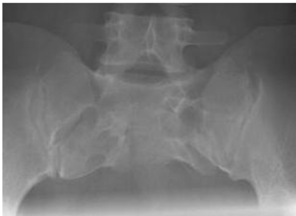
Figure 2 On conventional sacral X-ray a dysgenetic sacrum was seen.

Blood tests showed no abnormalities; particularly alpha foeto-protein and B-HCG were within normal ranges. MRI showed a large and previously not known anterior presacral meningocele (Figure 3) as well as a tethered cord due to a tight filum terminale (Figure 4). She refused testing for defects on the HLXB9 gene on chromosome 7q36. She was referred to a neurosurgeon and treatment of the meningocele consisted of a laminectomy S1-S2,