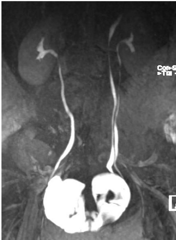
Figure 1 The MRI of our patient showed a double bladder with urinary output of both kidneys to the bladders.