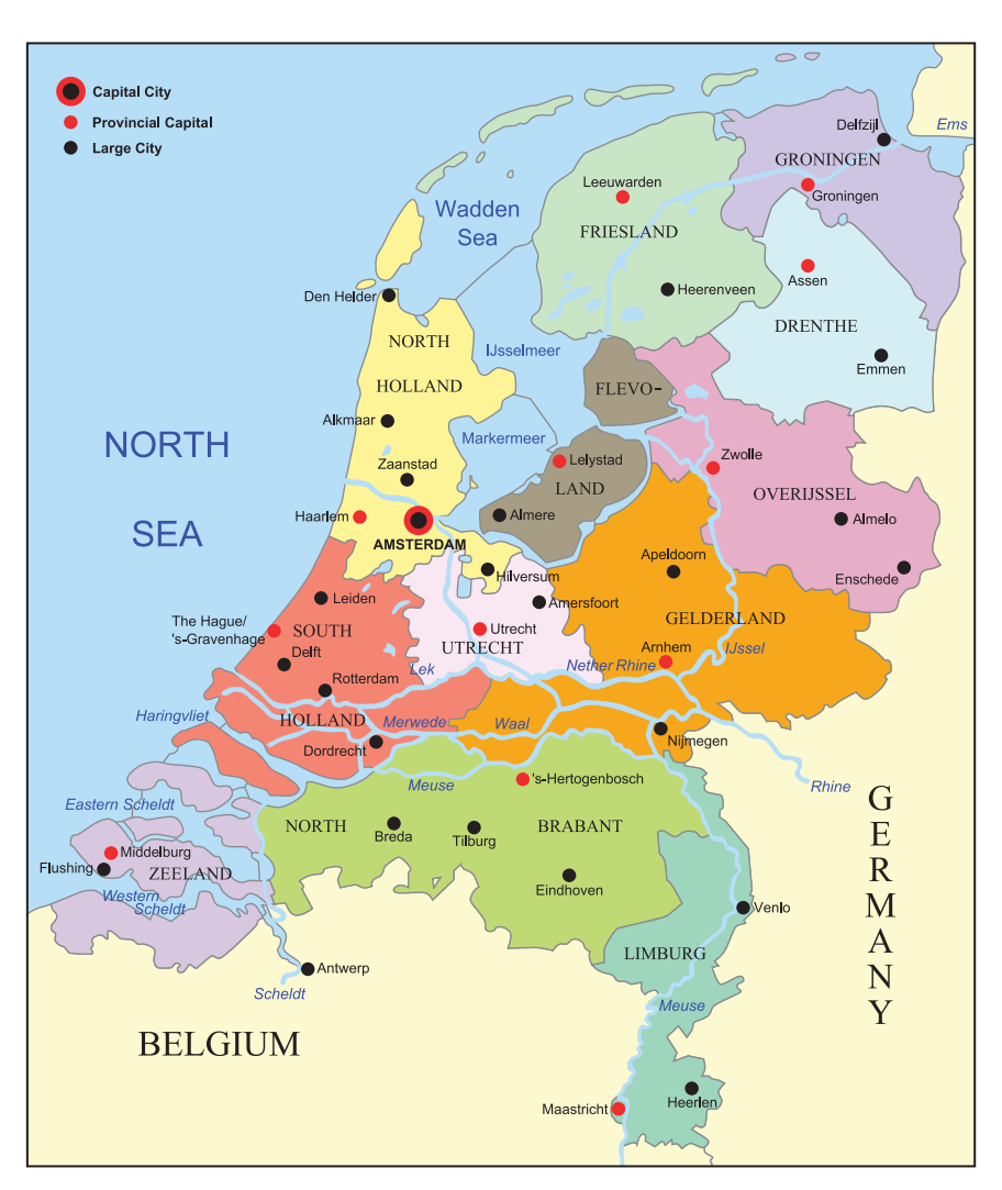
Figure 1 The 12 provinces of the Netherlands, the 12th province (Flevoland) is a recent province (land reclaimed from water) and was not included as a separate sampling unit (Image by Wikimedia Commons user Alphathon).

equal representation from the original 11 Dutch provinces (see Table 1), oversampling the two major cities Amsterdam and Rotterdam. The 12th province, which was established in 1986, was not included, as it was populated by recent immigration from surrounding areas.