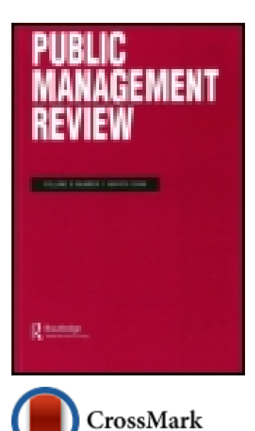
Click for updates

This article was downloaded by: [Erasmus University] On: 09 August 2015, At: 23:57 Publisher: Routledge Informa Ltd Registered in England and Wales Registered Number: 1072954 Registered office: 5 Howick Place, London, SW1P 1WG