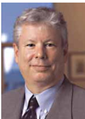
Richard H. Thaler, Professor

On Tuesday 8th November 2005, Erasmus University Rotterdam will celebrate the university's 92nd birthday with a ceremony during which an honorary degree will be conferred on Professor Richard H. Thaler, the Robert P. Gwinn Distinguished Service Professor of Economics, Finance and Behavioural Science at the University of Chicago's Graduate School of Business.