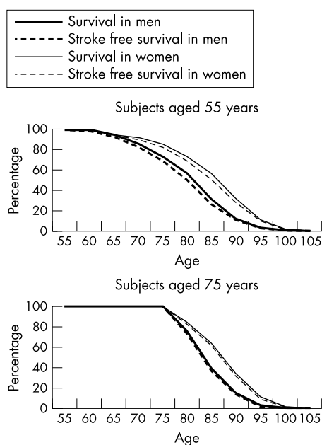
Figure 3 Survival and stroke free survival according to age and sex.

were confirmed by CT or MRI, the overall results on haemorrhages should be regarded carefully. Almost 95% of the cerebral infarctions were CT confirmed. Therefore, we feel that the overall figures on cerebral infarctions are reliable. However, incidence figures of stroke subtypes in the very old are less reliable.