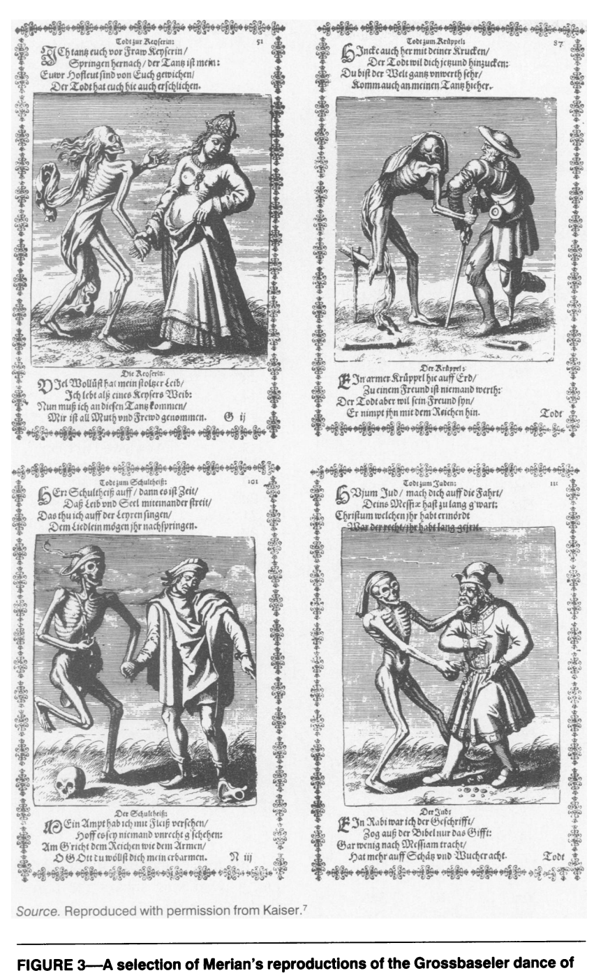
FIGURE 3—A selection of Merian's reproductions of the Grossbaseler dance o death: empress (3), beggar (21), sheriff (28), and Jew (33).

And, as a final example, the dead companion of the "official" says to him: