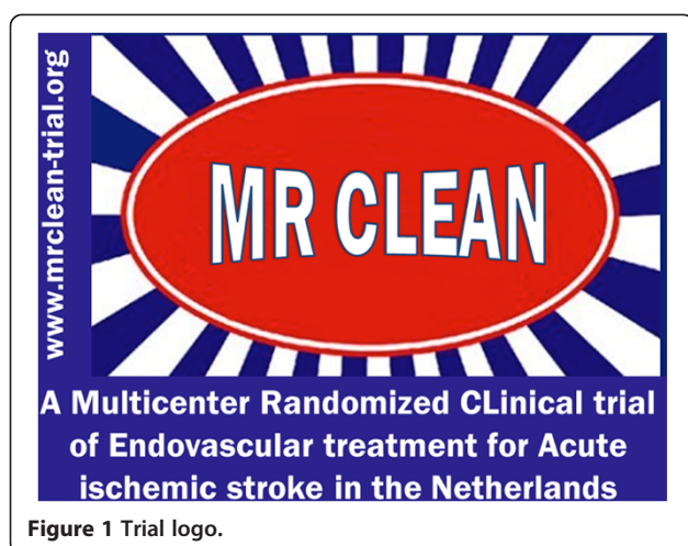
Figure 1 Trial logo.

The treatment is provided in addition to best medical management according to national and international guidelines, and may include IV thrombolysis. The study currently runs in 17 large hospitals in the Netherlands for a total period of 5 years (4 years of patient inclusion). Patient inclusion started in December 2010.