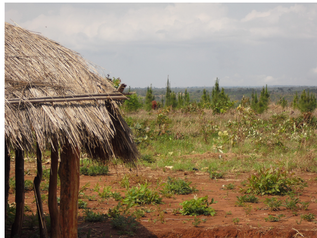
Fig 13 Niassa Province : rural community (left) and pine plantation coming close to the community (right)