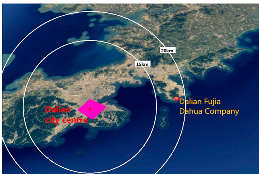
Figure 1. The location of Fujia PX plant in Dalian.

In addition to these actors and procedures at the central level, the network of actors in the Dalian case consists of the following local actors: The Dalian State-owned Assets Supervision and Administration Commission (SASAC) is a bureau of Dalian Municipality that is responsible for managing state-owned enterprises (SOEs) in the city, including appointing top executives and approving any mergers or sales of stock or assets. In September 2005, it signed a contract with Fujia Company, a private enterprise, to establish a new joint company, Fujia Dahua Petrochemical Co., with its subordinate SOE, Dalian Petrochemical Company, as the minority shareholder.